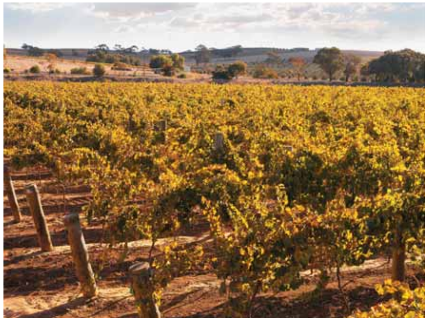
Mount Horrocks Cordon Cut Vineyard

Mount Horrocks Riesling, Semillon and Shiraz hail from her Watervale vineyard, the most northerly and highest vineyard in this famous sub-region of the Valley. The higher elevation suits the Mount Horrocks style. There's enough variation in soil and aspect that specific locations were chosen for each grape. The Riesling and Shiraz are planted on red loam over limestone and Semillon on slightly poorer soil that reduces vigour.